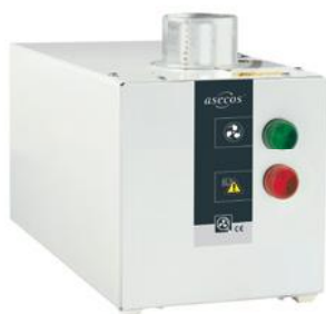
Extraction unit for tall cabinets, with exhaust air monitoring Order No. 14220