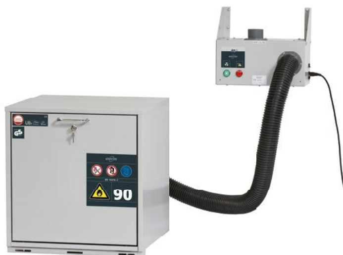
Extraction module for wall mounting for underbench cabinets, with exhaust air monitoring Order No. 24315 (underbench cabinet optional)