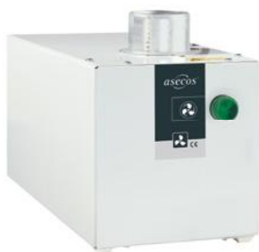
Extraction unit for tall cabinets, without exhaust air monitoring Order No. 14218