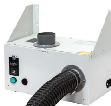
Extraction module for wall mounting for tall cabinets, without exhaust air monitoring Order No. 17178